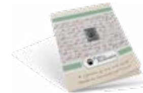
Choice of Ala'Carte Product